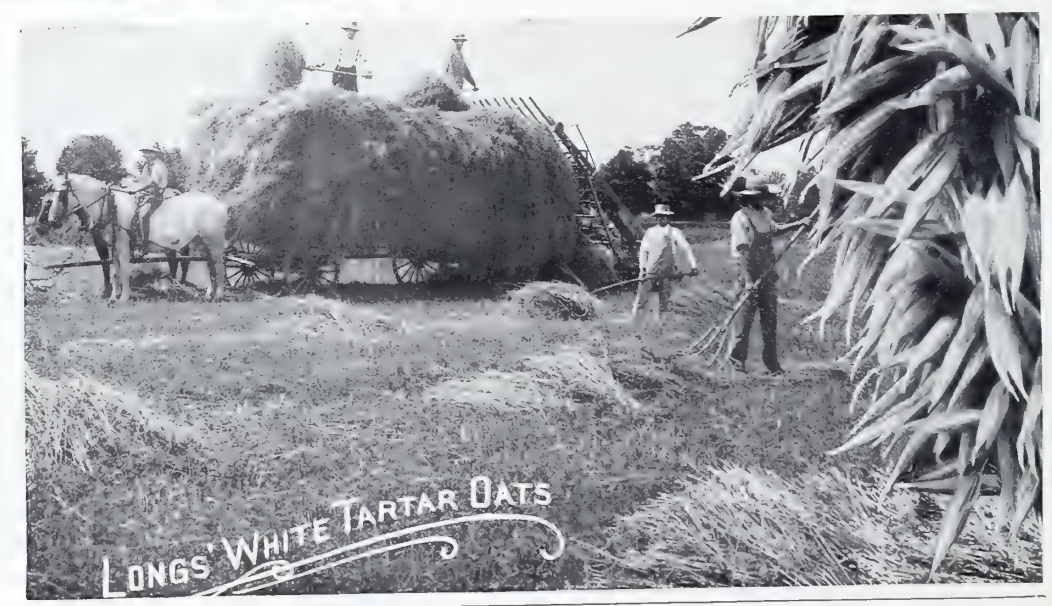
The Purchaser Pays Transportation Charges on Farm Seeds, Except Where Noted.

Price, peck, 80c; bushel of 32 lbs., $2.25; 10 bushel lots, per bushel, $2.20; 100 bushel lots, per bushel, $2.15.